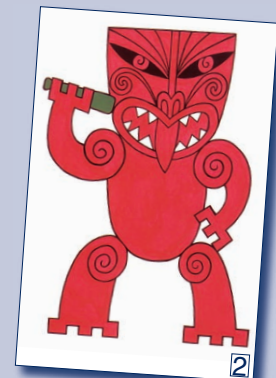
[Tūmatauenga – god of man/people or war/fighting]