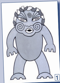
[Tāwhiri-mātea – god of wind/storms/weather/clouds/rain]