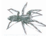
Actual size of an adult female white-tailed spider.

The bite can be painful but the burning, swelling, redness and itchiness quickly goes away and there are no long lasting effects. Putting ice on the bite can make it feel better.