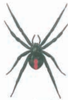
Actual size of an adult female redback

It is rare to be bitten by a redback as they will only bite when they are disturbed or trapped in clothing. The bite feels like a sharp pin prick and may lead to redness and pain where the bite occurred. If you are bitten you MUST go to a doctor.