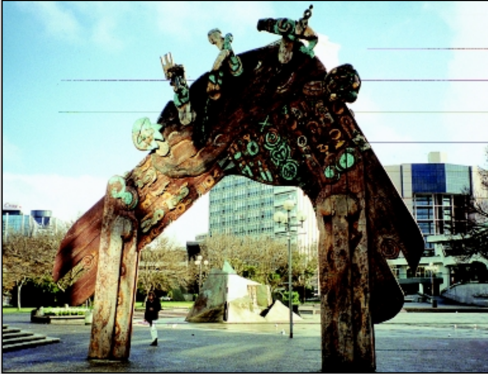
Year 8 sculpture