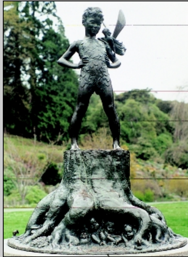
Year 4 sculpture