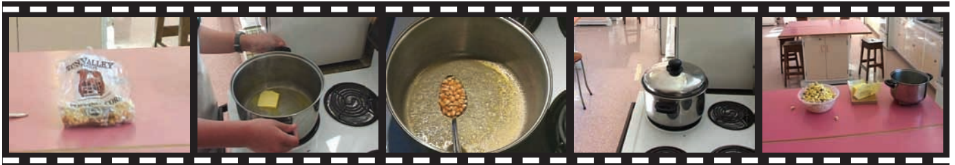
DESCRIPTION: Video of process from packet to popcorn, ready to eat. No voiceover; soundtrack of cooking sounds only.

Approach: One to one Focus: Instructing, directing Resources: Video on laptop computer, picture