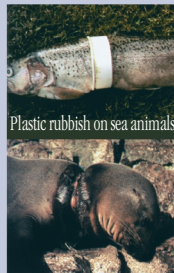
Plastic rubbish on sea animals

2. Let's look at your bottom row of pictures. You have put [read titles of pictures] in the bottom row. I want you to tell me why you think these are not as important as the other concerns.