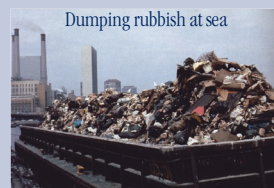
Dumping rubbish at sea