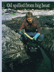
Oil spilled from big boat