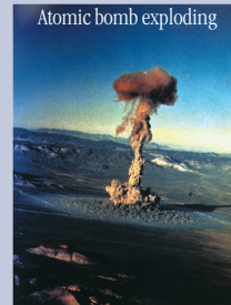
Atomic bomb exploding