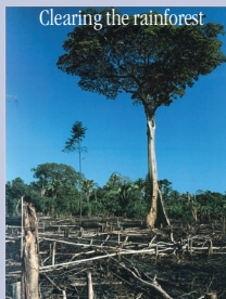
Clearing the rainforest